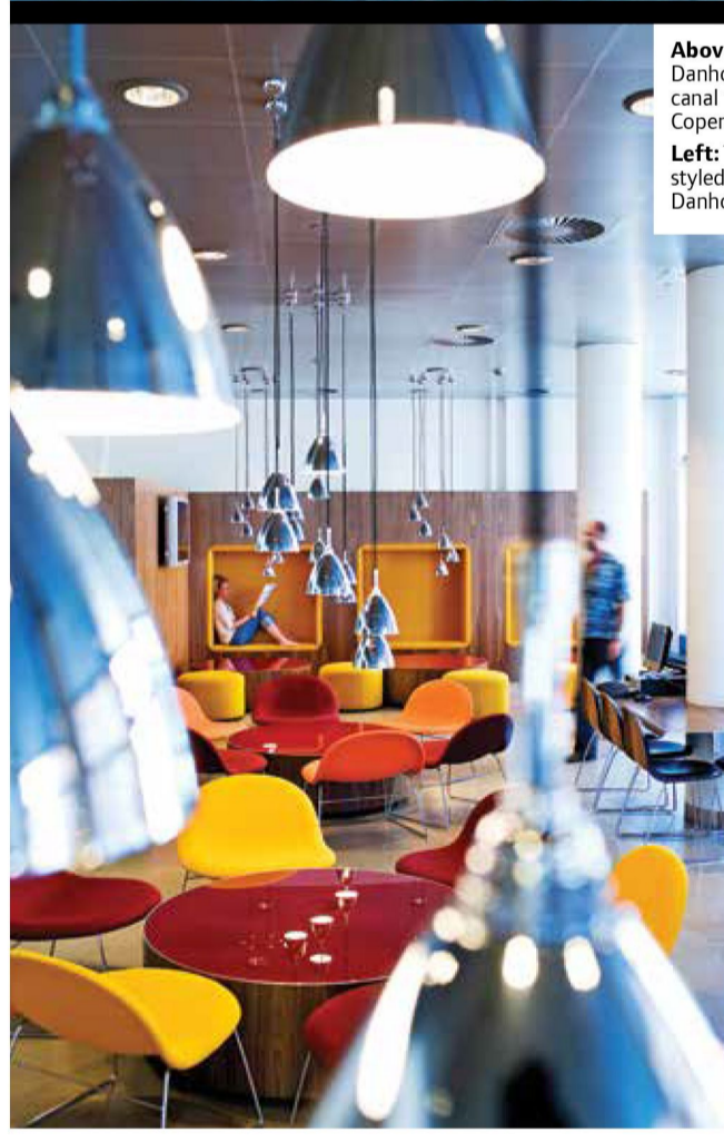
Above: The towering Danhostel seen from a canal tour in harbour of Copenhagen. Left: The contemporary-styled common room at Danhostel.