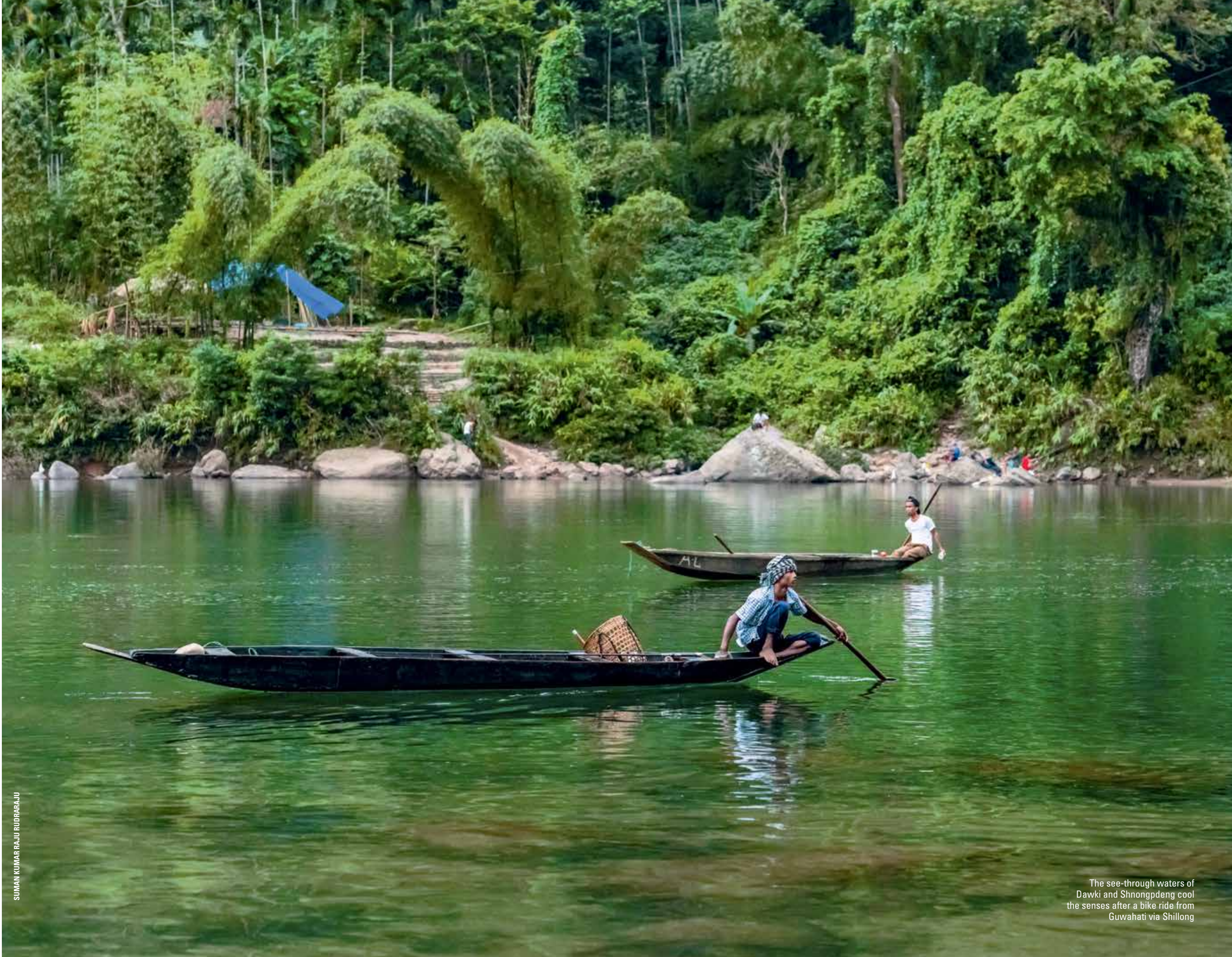
The see-through waters of Dawki and Shnongpdeng cool the senses after a bike ride from Guwahati via Shillong

Accommodation Polo Orchid Hotel (Cherrapunji), Pioneer Adventure Camp (Shnongpdeng)